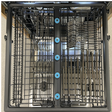
3rd basket layout