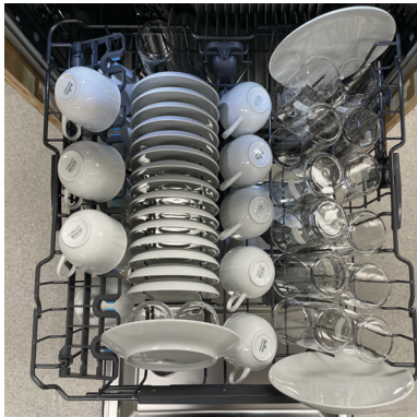
Upper basket layout