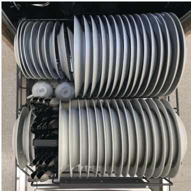
Lower basket layout